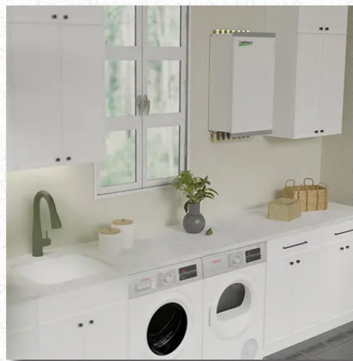
Cetetherm Pioneer comes in a compact and stylish design.